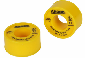
PREMIUM (1.0) DENSITY

Click Here to Purchase Download Tech Data Download SDS