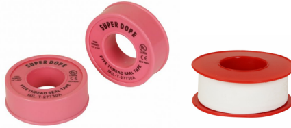
HIGH (0.8) DENSITY

Click Here to Purchase Download Tech Data Download SDS