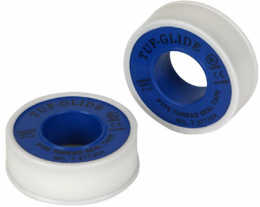
INDUSTRIAL (0.4 DENSITY)

When it comes to options, ARGCO has more options than most. Standard Density, High Density, or Premium Density Gas Tape. ARGCO offers it all, including domestic or import. So, if you have a specific need for a PTFE tape, ARGCO can supply the product for you.