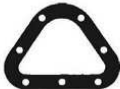
VALVE BRACKET COVER GASKET (355-73) Part #333600 For Products: 3155