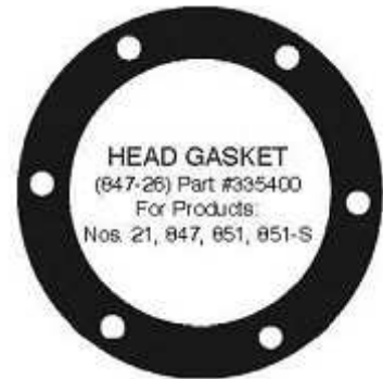
HEAD GASKET (847-26) Part #335400 For Products: Nos. 21, 847, 851, 851-S