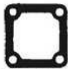
GUIDE PLATE GASKET (355-16) Part #333600 For Products: 3155