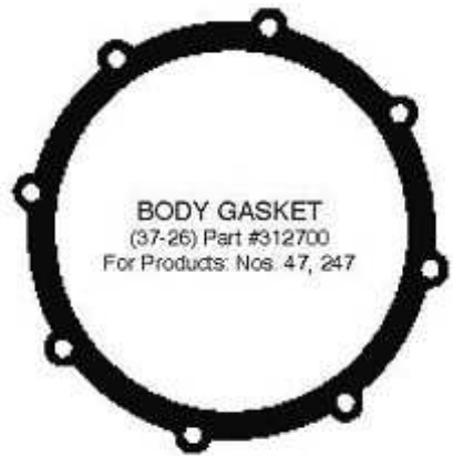
BODY GASKET (37-26) Part #312700 For Products: Nos. 47, 247