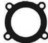
VALVE BRACKET GASKET (21-27) Part #311100 For Products: 21, 25A, 27W