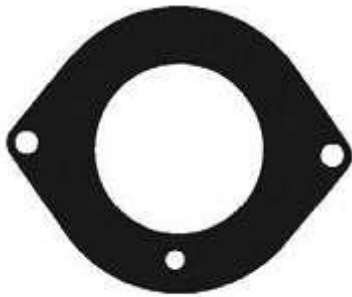
HEAD GASKET (92-68) Part #323300 For Products: 94 Series