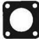
GASKET (37-39) Part #313200 Blow-Off Valve 14B, 47, 67, 70B