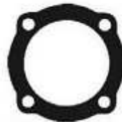
VALVE BODY GASKET (21-12) Part #310800 21 Series