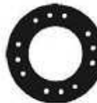
BELLOWS FLANGE GASKET (67-12) Part #318600 For Products: Nos. 61, 64, 67, 69, 70, 70B, 767