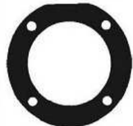
HEAD GASKET (CO-12) Part #302600 For Products: Nos. 42, 61, 63, 64, 65