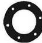
BELLOWS BASE GASKET (CO-11) Part #302500 For Products: Nos. 63