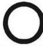
VALVE BRACKET GASKET (37-27) Part #312600 For Products: Nos. 47, 247, 51, 51-S, 53, 3155, 551-S, 847, 851, 851-S