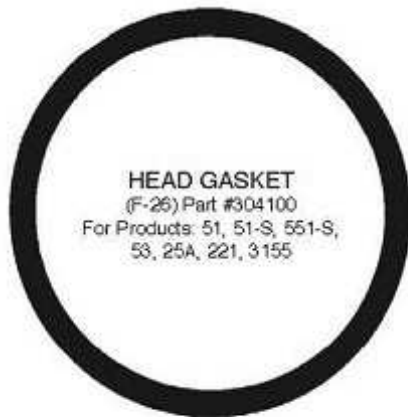
HEAD GASKET (F-26) Part #304100 For Products: 51, 51-S, 551-S, 53, 25A, 221, 3155