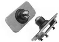
Ball Transfer head Fits over V-Head